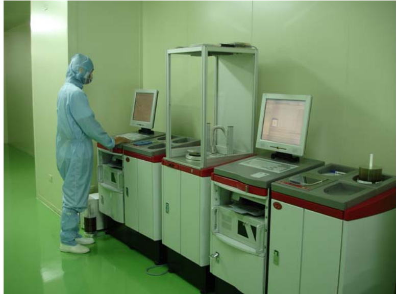
Figure 1: DaTABANK systems and CoverTest unit installed at BestDisc Lab

Mastering, galvanic and replication lines were installed and optimized earlier this year and, to help control and fine-tune their manufacturing process, BestDisc relies on its DaTABANK equipped with a BD driveCube, along with the CoverTest™ stamper testing technology developed by DaTARIUS.